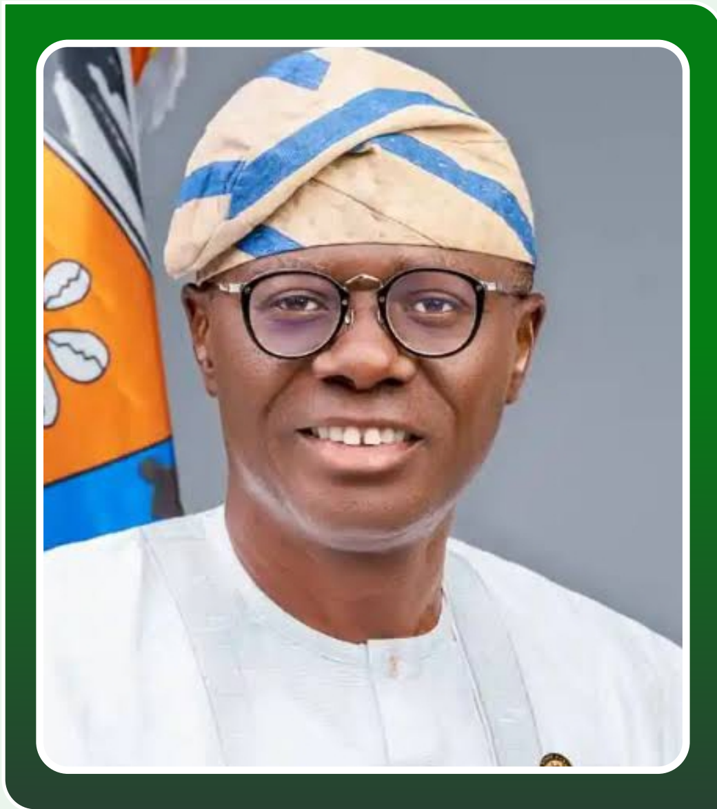
HIS EXCELLENCY BABAJIDE OLUSOLA SANWO-OLU Governor of Lagos State